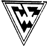
EXHIBIT "1" TO DECLARATION OF CONDOMINIUM OWNERSHIP FOR STEEPLE CHASE CONDOMINIUM II